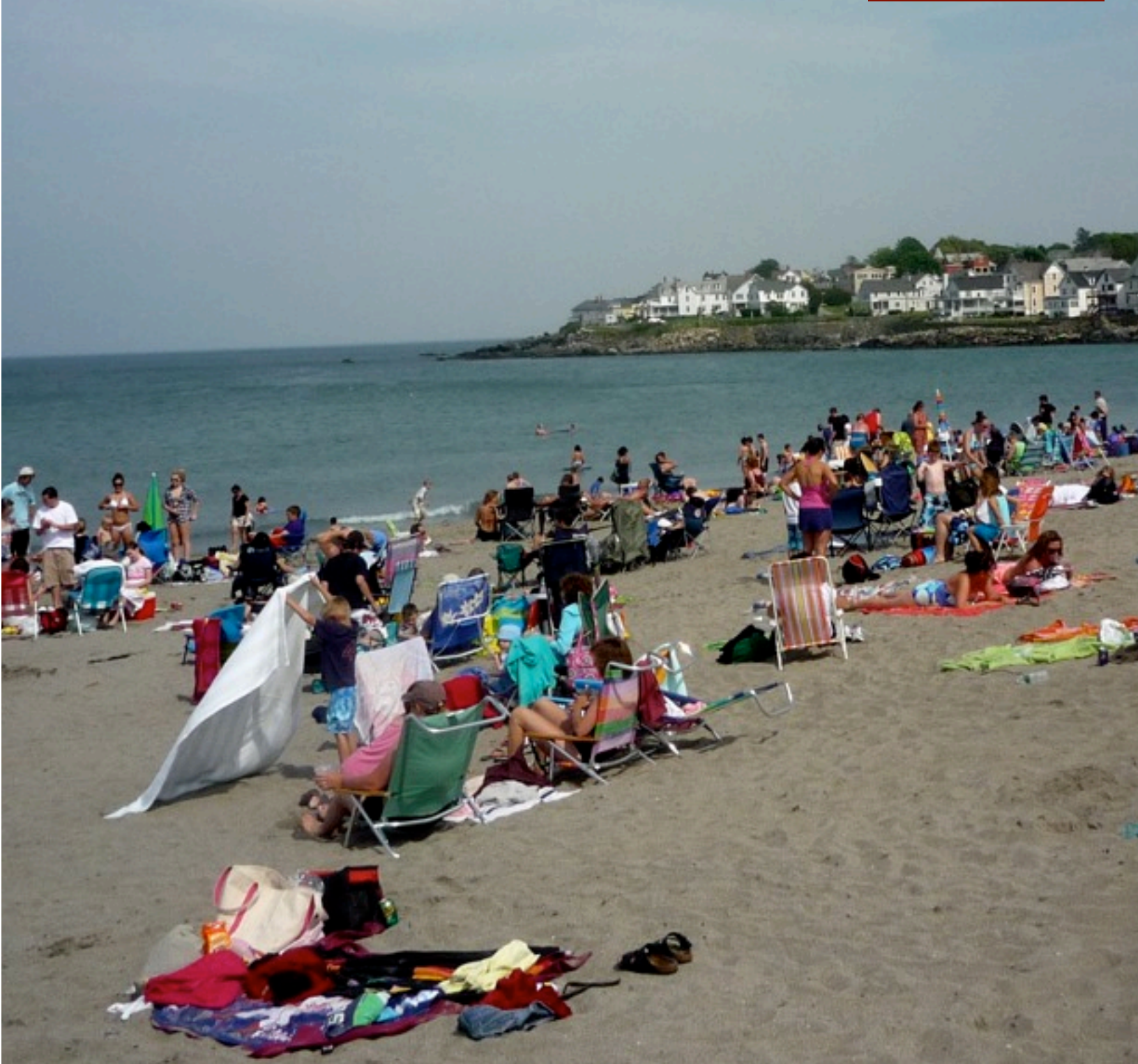
Short Sands Beach York Beach, Maine