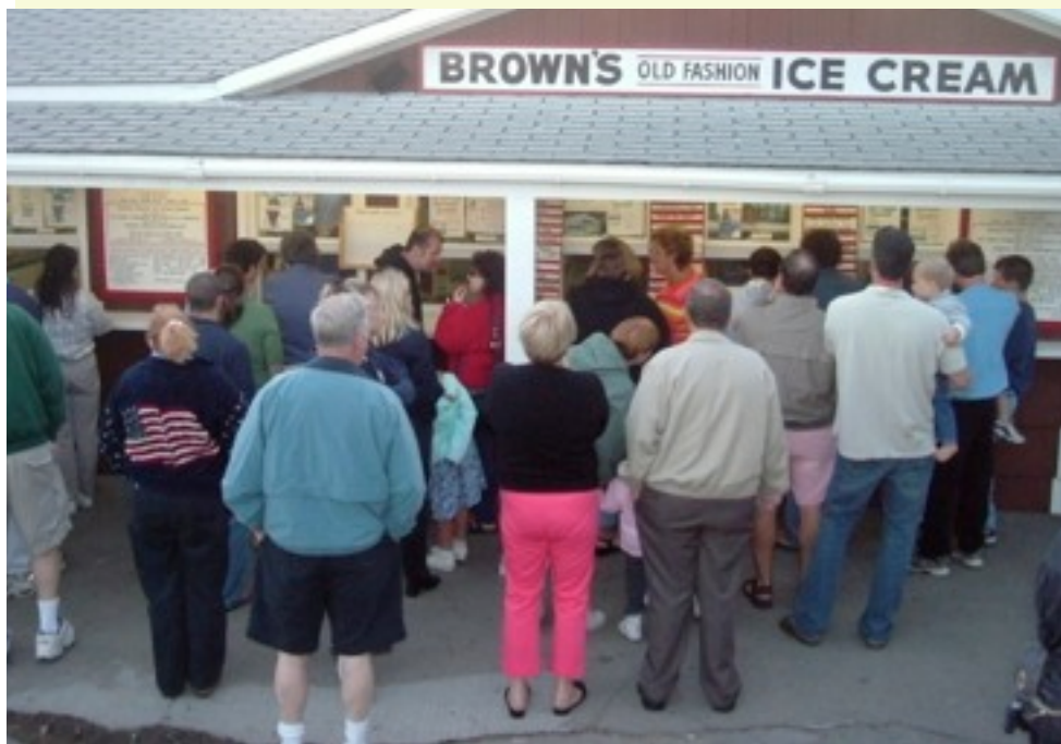
Brown's Ice Cream, Cape Neddick, Maine

It would be an injustice to not experience a New England ice cream stand during the summer. Almost never the focal point of the day, it is more a perfect companion to the beach, the mountains, a Sunday drive, or as an alternative to staying in air conditioning during the hot summer months. In its own right, the New England ice cream stand many times stands on its own as a nice scenic place to be as many have their own farms, animal displays, or at the very least a peaceful atmosphere to enjoy the flavor of your day. Full Story