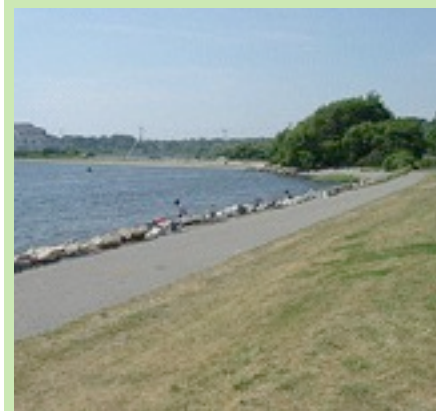
East Bay Bike Path, Bristol, R.I.

Tight on money? You can still vacation in grand style, locally, with these simple yet fun ideas!