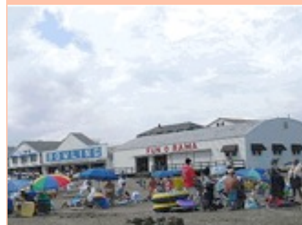
Short Sands Beach, York Beach, Maine

It's hard not to have your head in the sand when choosing the best ocean beaches in New England. Choose a great beach and someone will come back with an even better one. Full Story